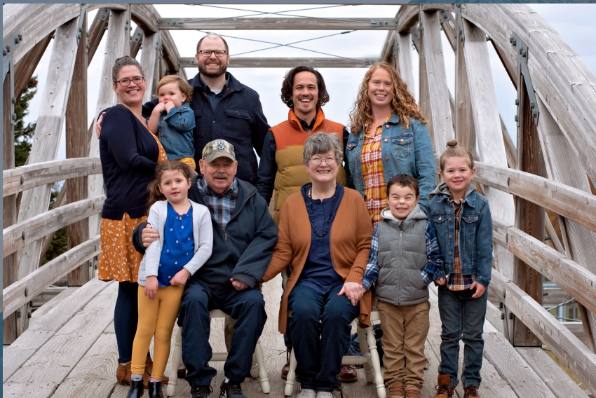
Family Photoshoot, Fall 2019